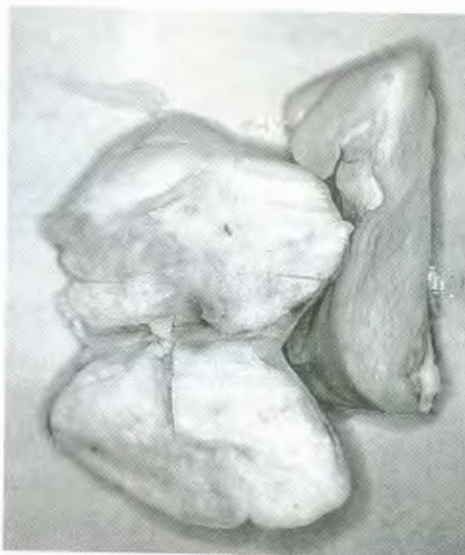
Fig II Cellular area of tumour in which many of tumour cells resemble signet ring cells. H x E x 300.

acterised by spindle cells and lipid containing round or oval cells. Some of the latter may have a signet ring appearance and thus simulate a Krukenberg tumour. All sclerosing stromal tumour have to date, pursued a benign course, local excision is adequate therapy.